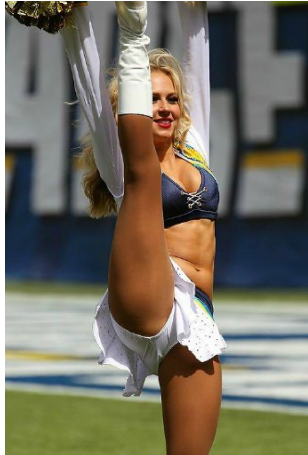
Chargers Cheerleaders give great kicks!