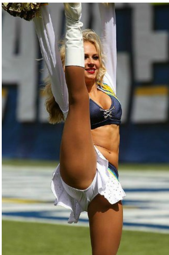
Chargers Cheerleaders give great kicks!