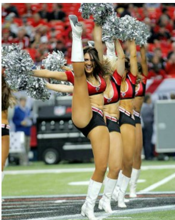
Falcons Cheerleaders are great kickers too!